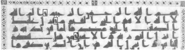
Image from chapter 3 of the Gold Qur’an dated around 800 AD. 2 which shows a verse stop after the ‘Basmallah’

Research into this matter by looking at the older texts has been unable to yield the background or rationale into this different treatment for the Basmallah, however, what is apparent is that even with the oldest surviving copies, the Basmallah prefixes nearly all chapters/suras.