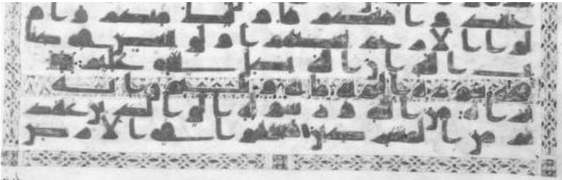
Image from chapter 9 of the Gold Qur'an showing inserted chapter name to mark separation

In reviewing the older written texts, it was found that the older texts indeed do not carry a Basmallah for chapter 9, and that the ability to realize the separation between chapters 8 and 9 is achieved through a man-made injection of the chapter name to highlight the beginning of a new chapter.