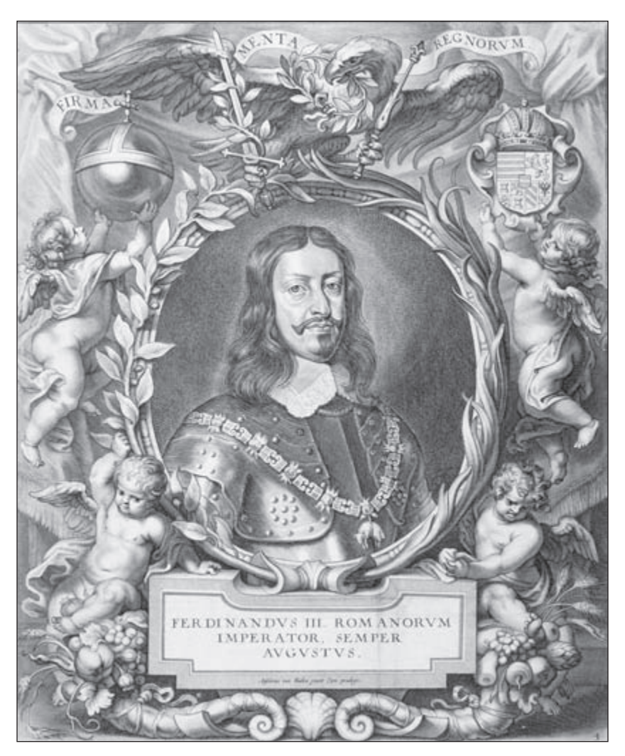
Ferdinand III, Holy Roman Emperor, around 1650–1655, copy after Anselm van Hulle, in Pacificatores Orbis Christiani , 1697.