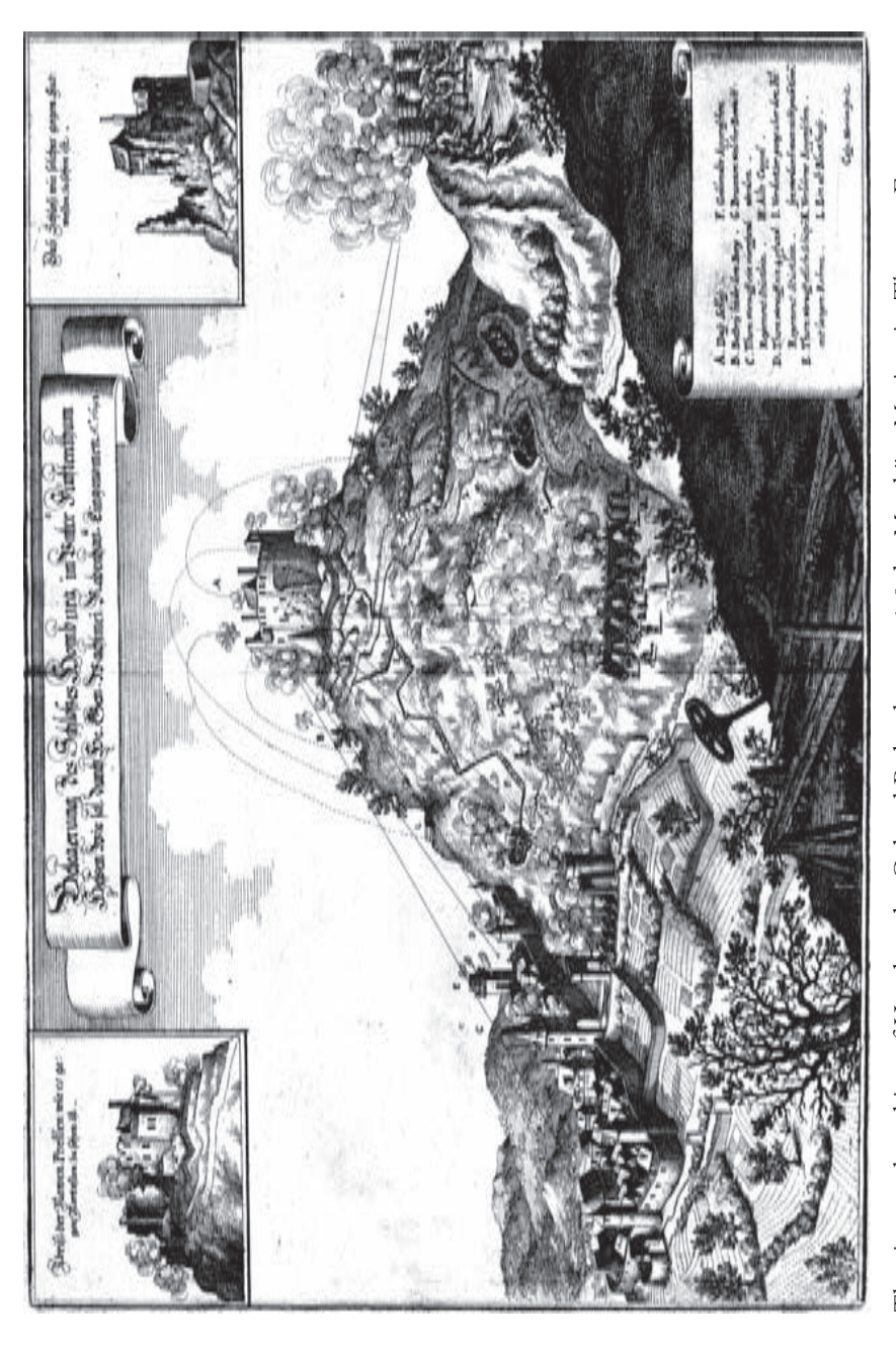
The siege and retaking of Homberg by Colonel Rabenhaupt, 1648, by Matthäus Merian, in Theatrum Europaeum, vol. 6, 1663.