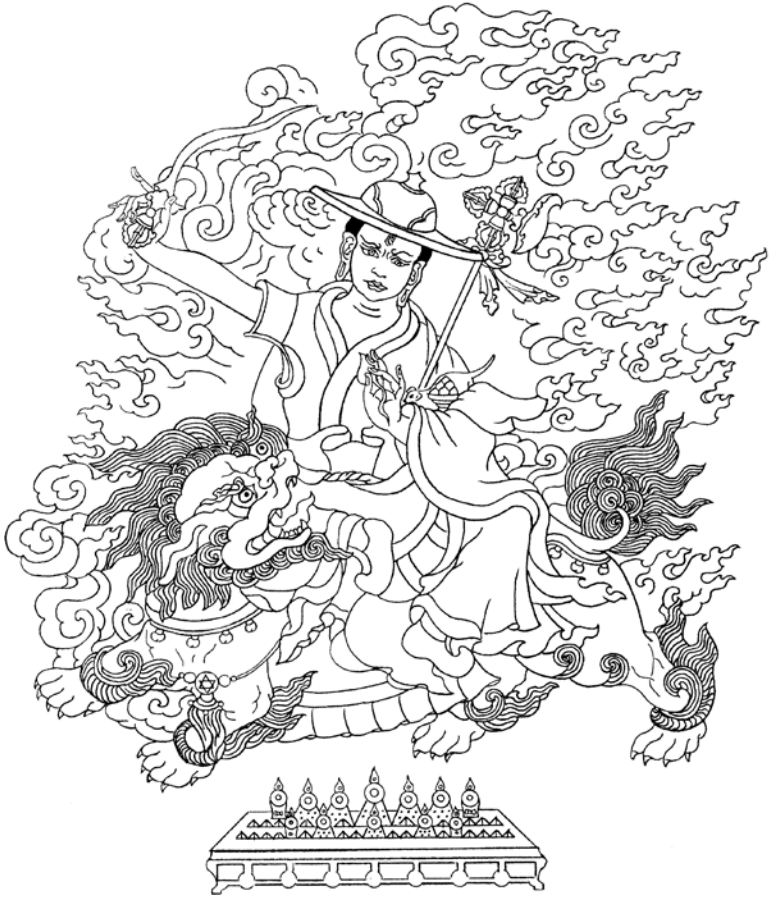
Wisdom Dharma Protector