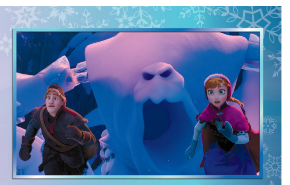
Kristoff and Anna are chased by a giant snowman that's protecting Elsa's ice palace!