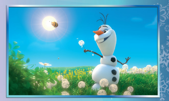
Olaf is made of ice and snow, but he dreams of running through flowering fields on a warm summer day.