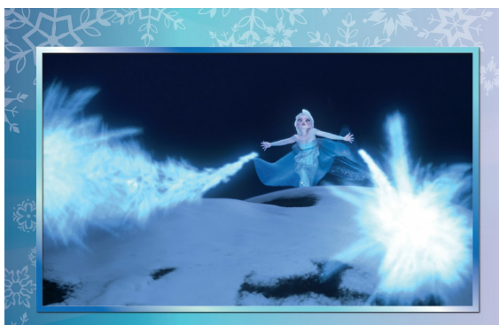
Elsa stirs up a wild winter storm over the North Mountain. For the first time, she doesn't need to hide her power.