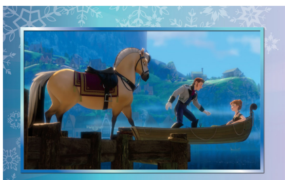
Prince Hans comes to Arendelle for the coronation. He makes an immediate impression on Anna.