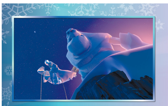
Anna cuts the rope to escape from the giant snowman. She and Kristoff tumble down the mountain!