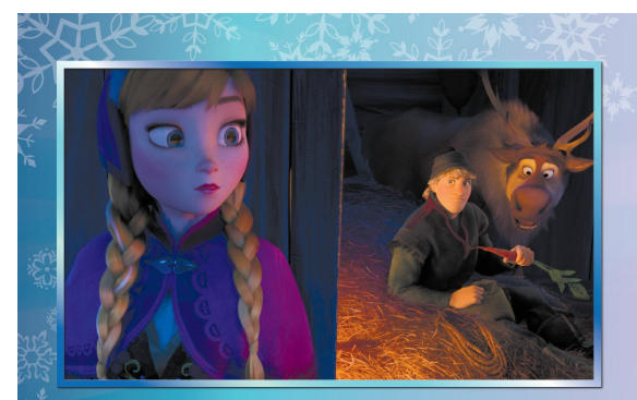
Anna wants Kristoff to be her guide through the snowy mountains.