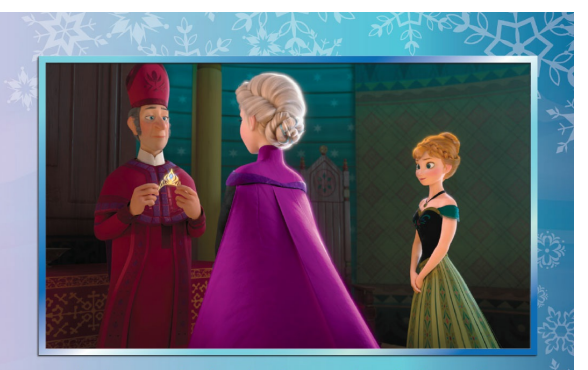
As Anna watches her sister's coronation, she has no idea how afraid Elsa is that her magical secret will be revealed.