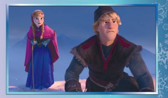
Anna and Kristoff are trapped at the edge of a cliff. The only way to escape is by lowering themselves down with a rope.