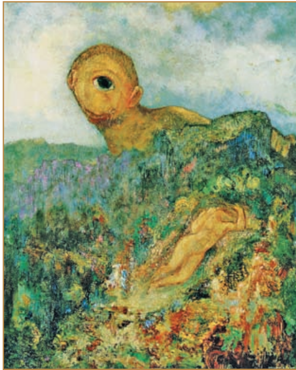
The Celts believed the sun was a one-eyed god who stared at the world each day. ( The Cyclops (1914) by Odilon Redon)

EXCALIBUR The magical sword of King ARTHUR, given to him by a DRUID or priestess known as the Lady of the Lake. According to Arthurian legend, as long as he carried it, he could not be defeated.