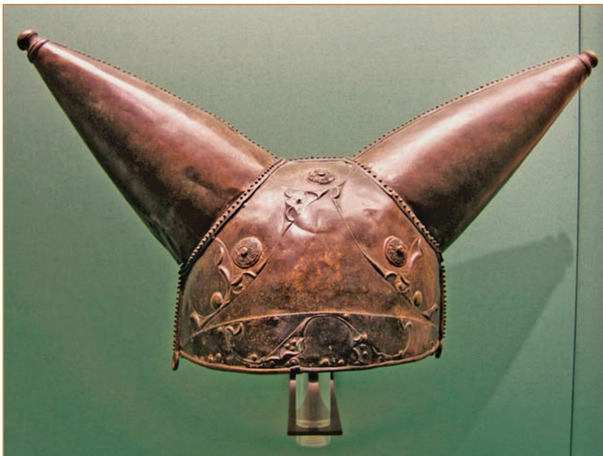
Celtic warriors often wore horned helmets to evoke the power of horned gods like Cernunnos. This helmet dates from the first century B.C. and is decorated in the La Tène style.

HORNED GOD Early Celtic gods were often depicted with animal horns or antlers on their heads. Such horns were believed to be a symbol of male strength. The most prominent of the horned gods was the GAUL CERNUNNOS. The Gaul god CAMULUS and the British god COCIDIOUS were sometimes depicted with the antlers of a deer.