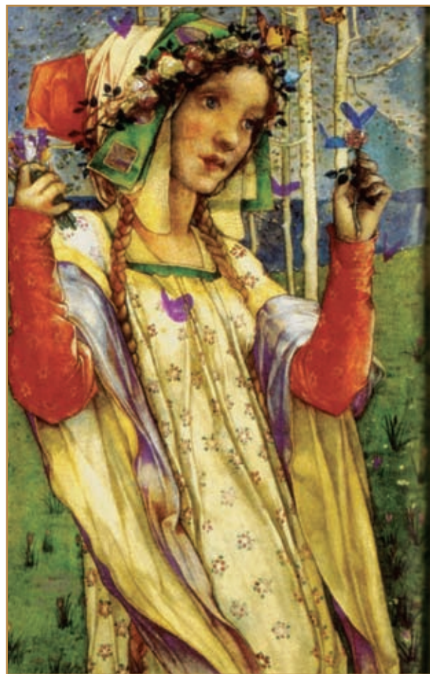
Edward Reginald Frampton imagines the Celtic fairy in his 1906 painting, Fairy Land .

The solitary fairies are tricksters and bring bad luck, and are described in POET W. B. YEATS'S compilation The Book of Fairy and Folk Tales of Ireland . The leannan sidh is a female fairy, sometimes called a poet's muse for her gifts of inspiration and charm. Yet