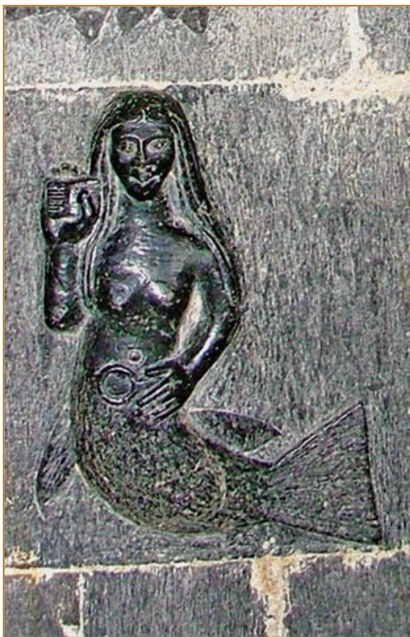
This image of a mermaid was carved into the south chancel arch of Clonfert Cathedral in County Galway, Ireland.

love, a mermaid tempts an unsuspecting man by bringing him precious jewels, pearls, and gold coins. Then she lures him underneath the waves, promising to show him a storehouse of treasures that she guards for the gods of the sea. There, the mermaid keeps the man prisoner for her own amusement, tethering him to a long, golden chain, like a dog on a leash. Encounters with mermaids always end in disaster.