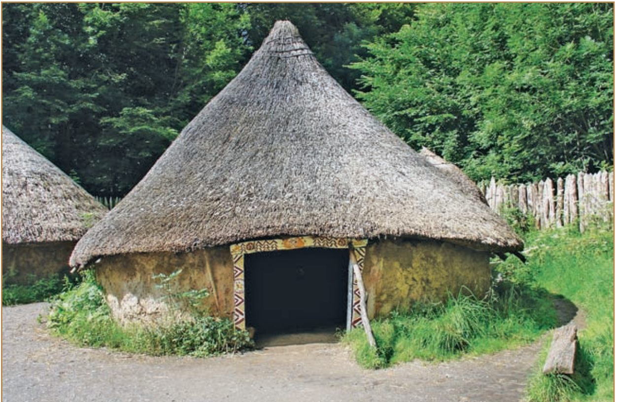
Replica of an ancient Celtic hut at the St. Fagan's Open Air Museum in Cardiff.

But above all, the Celts were great warriors. Their skill in warfare helped bring them to dominance across western Europe. Tribes often fought among themselves and a minor slight could provoke a fierce battle. Despite their skill at weaponmaking