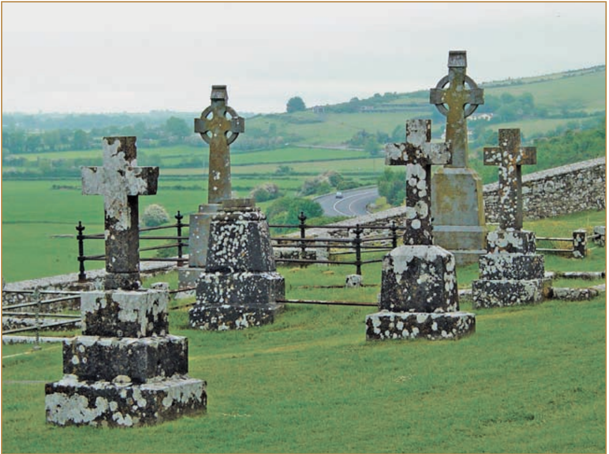
A group of Celtic high crosses mark a burial plot in Ireland.

seen in the elaborate designs of the Christian Book of Kells.