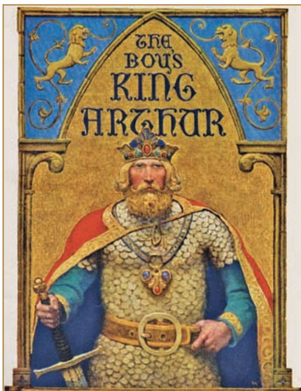
King Arthur as depicted by N. C. Wyeth for the 1922 children's edition of Sir Thomas Malory's History of King Arthur and His Knights of the Round Table . Arthur is dressed in the armor from the late medieval period.

Welsh tales. The son of IGERNA, queen of Cornwall, and the Welsh prince Uther PENDRAGON, Arthur was revered as a wise and brave leader. As a boy, he proved that he was the rightful heir to the throne by pulling an enchanted sword from a stone. When that sword broke, the magical Lady of the Lake gave him a new one. Named Excalibur, it rendered Arthur invincible in battle. (See also ARMS AND ARMOR.) Like Fionn, Arthur is said not to be dead, but to be awaiting his time to return to Britain in its hour of need.