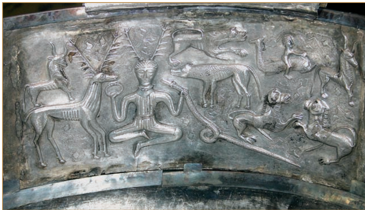
"Lord of the animals," the horned god Cernunnos, is depicted holding a torc and a ram-headed serpent in this scene on the Gundestrup Cauldron.

CAULDRON A kettle-shaped vessel used for cooking and ritual ceremonies. Cauldrons play a role in several Celtic myths. The CAULDRON OF DAGDA is one of the treasures of the TUATHA DÉ DANANN. CÚCHULAINN brought two magic cauldrons to Ireland from Scotland. A cauldron of rebirth appears in Welsh tales of war. It has the power to bring the dead