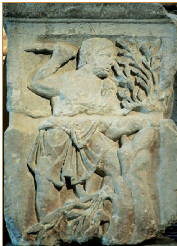
A carving on the Pillar of Nautes shows the Gaul woodcutter god Esus chopping down a tree whose branches shelter three birds and a bull.

ÉTAÍN A renowned and divine beauty of Ireland; perhaps a sun goddess (see also SUN GODS AND SUN GODDESSES). She may also have connections to the HORSE goddess EPONA and the princess RHIANNON. Étaín is the heroine of several conflicting tales. The