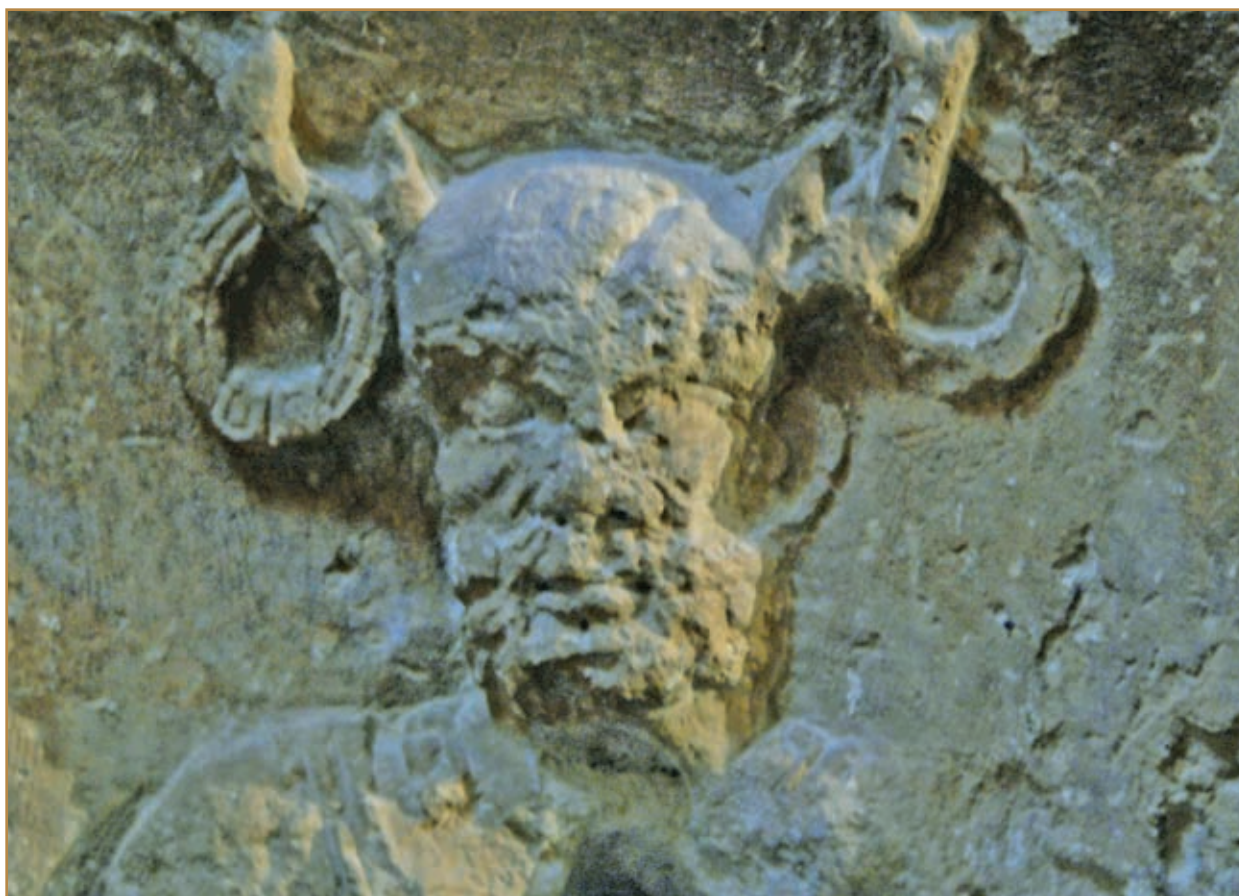
A carving of Cernunnos as a stern, horned god with a torc on each horn appears on the ancient pillar of Nautes in Paris. In earlier images, Cernunnos was depicted as a gentle spirit with antlers.

CESAIR (1) The leader of the first group of people to invade and settle in Ireland in the BOOK OF INVASIONS , a mixture of mythical and biblical history. She arrived on the ISLAND by boat 40 days before the great Flood after being denied passage on the ark built by her uncle, Noah. Her father, Bith, and her brother, Adná, accompanied her, with Adná sometimes filling the role of her husband.