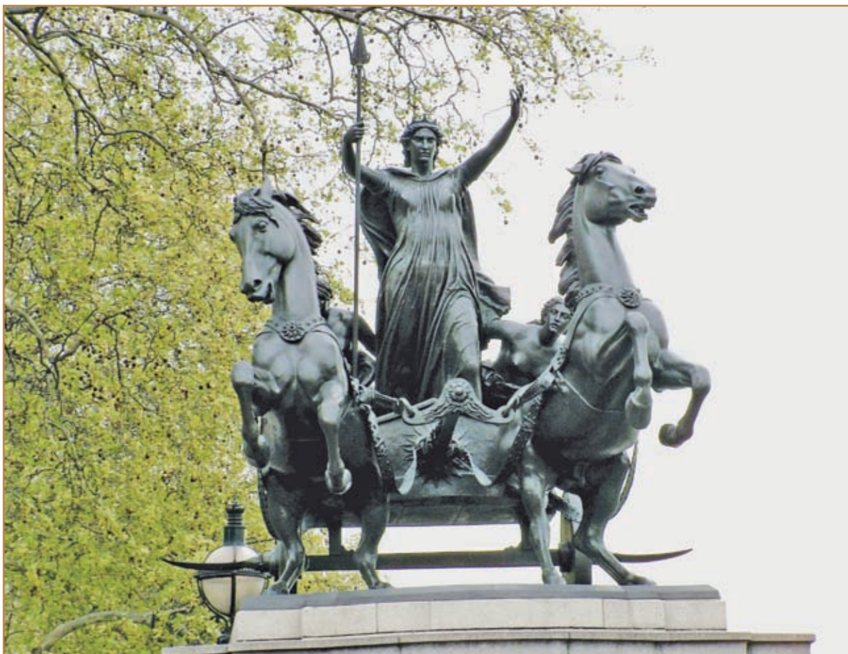
This statue of Boudicca by Thomas Thornycroft shows the Iceni queen confronting the Romans in full warrior regalia. Her two daughters sit behind their mother.

ambushed General Quintus Petilius Cerialis and his 6,000 legionnaires as they marched south. His entire infantry excepting for 500 cavalry officers was slaughtered. The general retreated back to his fortress in the north. Next, Boudicca's forces attacked the Roman headquarters in the south. Her troops forced the defenders to retreat. After a two-day battle, Boudicca's forces took over the heavily fortified Temple of Claudius.