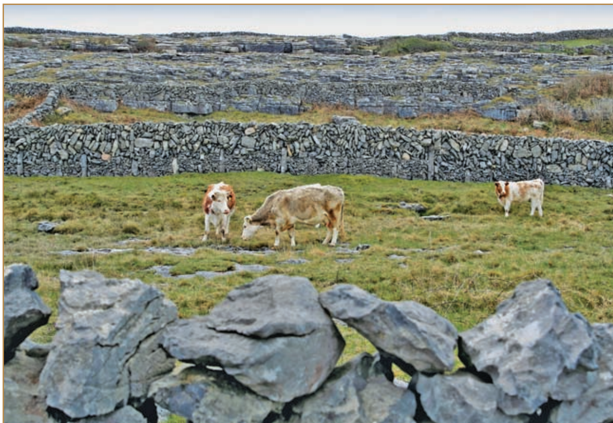
Cattle were an important source of food and leather for the ancient Celts, who built stone fences, many of which are still in use today, to keep their herds from straying.

COWS AND OTHER LIVESTOCK Agriculture and farming were important to the Celtic peoples, as were the livestock that helped them with their work