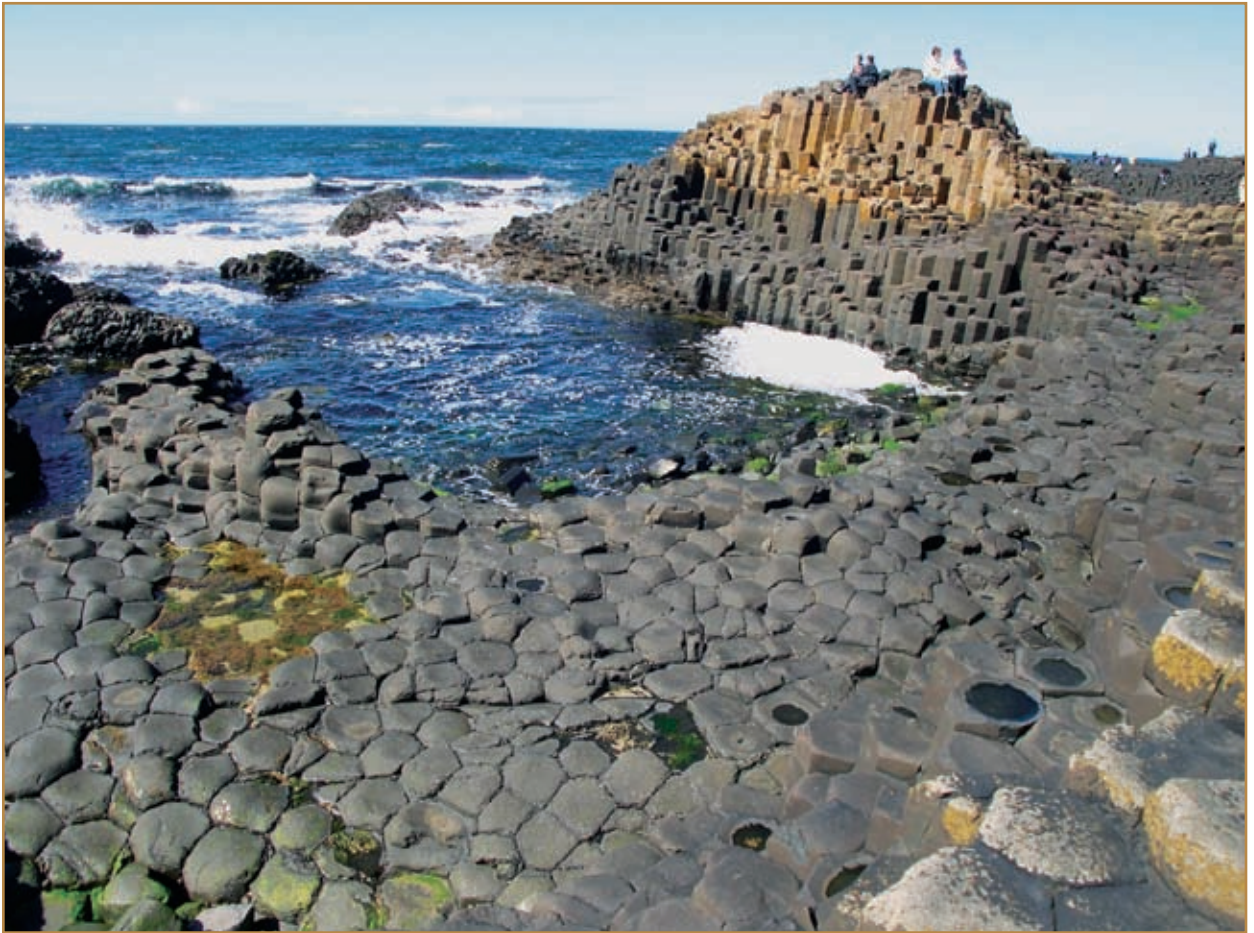
Giant's Causeway, on the northeast coast of Northern Ireland. According to legend, Irish giant Finn McCool built Giant's Causeway ( Clochán na bhFómharach) on his way to fight a Scottish giant named Benandonner.

FINNÉCES (FINEGAS) The DRUID who unintentionally helped FIONN gain the power of DIVINATION. When Finnécés caught the SALMON of knowledge, he gave it to his pupil, Fionn. While cooking the fish for the druid, the boy burned his thumb and put it into his mouth to soothe the pain, thus gaining the fish's magical power.