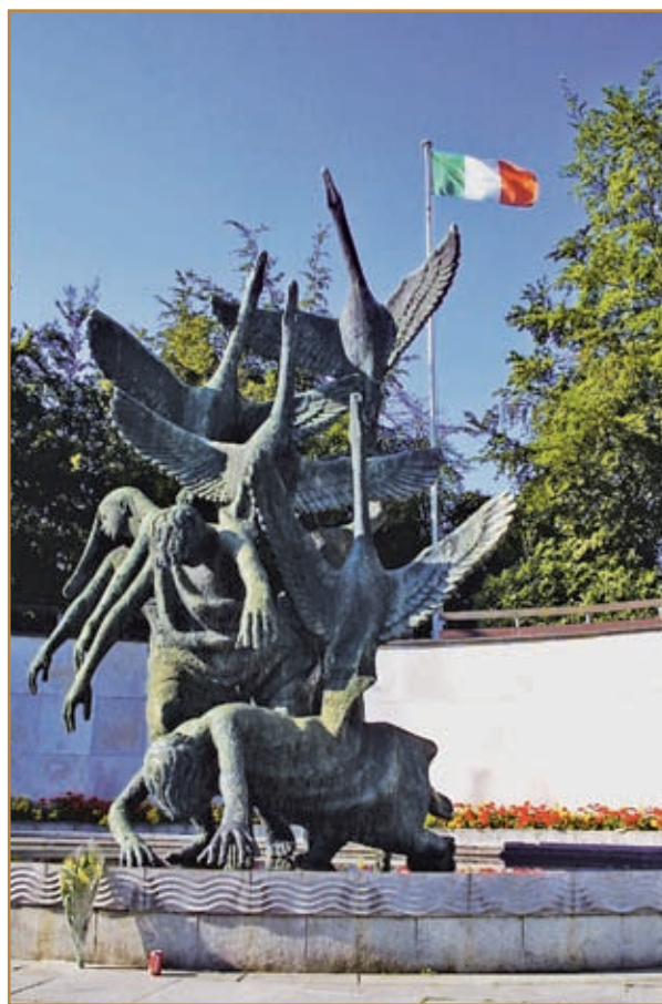
Statue of the children of Lir in the Garden of Remembrance in Dublin, Ireland.

The Tragic Story of the Children of Lir Lir married Eve, who bore him four beautiful children—FINNGUALA, ÁED (1), FIACHRA, and CONN. When Eve died, Lir was left to raise their four children. Although