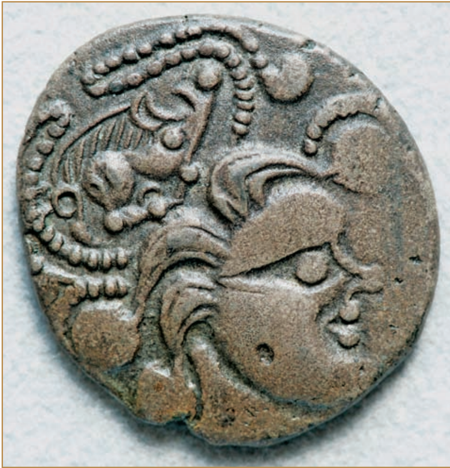
Celtic coins featured images of the gods, not human rulers. This coin from Gaul depicts the head of a god, perhaps a hunter, and a boar captured by the god's woven rope.

The Celts held their poets in high regard. During the Middle Ages, long after the glory days of the Celtic peoples had passed, Irish monks preserved many ancient Celtic myths by writing them down. There are several important written sources of Celtic myth. The most important is the LEBOR GABÁLA , or the BOOK OF INVASIONS . The stories in this collection are a combination of mythology, legend, history, and biblical events. Together, they form the invented “history” of how Ireland was settled by gods and mortals. The book begins with the biblical flood and describes several generations of settlers, ending with the ancestors of the Celtic people. Another important source of information is the Welsh collection of manuscripts called the MABINOGION . Its stories describe the mythical history of Britain, including early stories of Arthur.