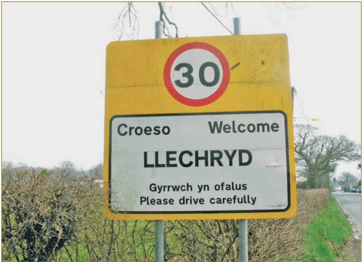
A sign in modern Wales written in English and Cymraeg, the Welsh language that dates back to Celtic times.

Cú Roí met Cúchulainn yet again in TÁIN BÓ CÚAILNGE ( THE CATTLE RAID OF COOLEY ), in which MEDB averted a duel between the two warriors. During their last meeting, Cúchulainn killed Cú Roí with the help of Bláithíne, Cú Roí's unfaithful wife.