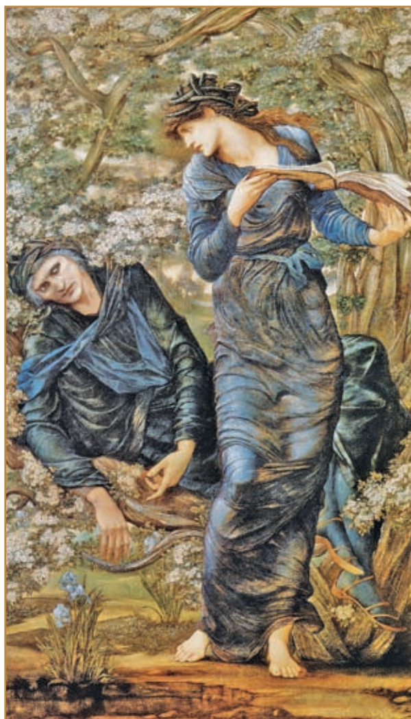
The Beguiling of Merlin (1874) by Edward Burne-Jones depicts the wizard Merlin under the love spell of the fairy Nimuë.

MERLIN (MRYDDIN) In the popular tales of King ARTHUR and his Knights of the Round Table, Merlin is the wizard who raises young Arthur, helps him become KING, and uses magic to help Arthur defeat his enemies.