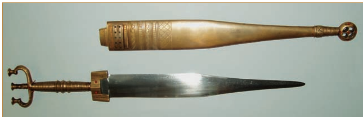
This 16-inch dagger and sheath made of iron, and bronze, and decorated with coral, was found in the grave of a Celtic prince in Hochdorf, Germany. The wheel on the bottom of the sheath signifies the sacred wheel of Taranis.

used for rituals and sacrifices to the gods. Wealthier warriors were more likely to have well-made arms and armor. Archaeological evidence shows that warriors were sometimes buried with their finest weapons, illustrating the importance of arms and armor in the warrior cult.