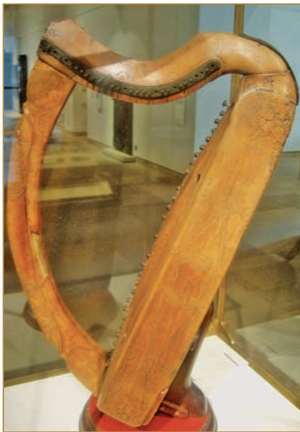
This Scottish harp, or clàrsach, is one of only three surviving medieval Gaelic harps and is now in the Museum of Scotland in Edinburgh.

Celtic figures were often merged with Christian ones in the early years of Christianity. For example, Celtic figures appear in a hunting scene carved on a pillar at the Christian monastery of Clongmacnois in County Offaly. Celtic monsters and ANIMALS can be