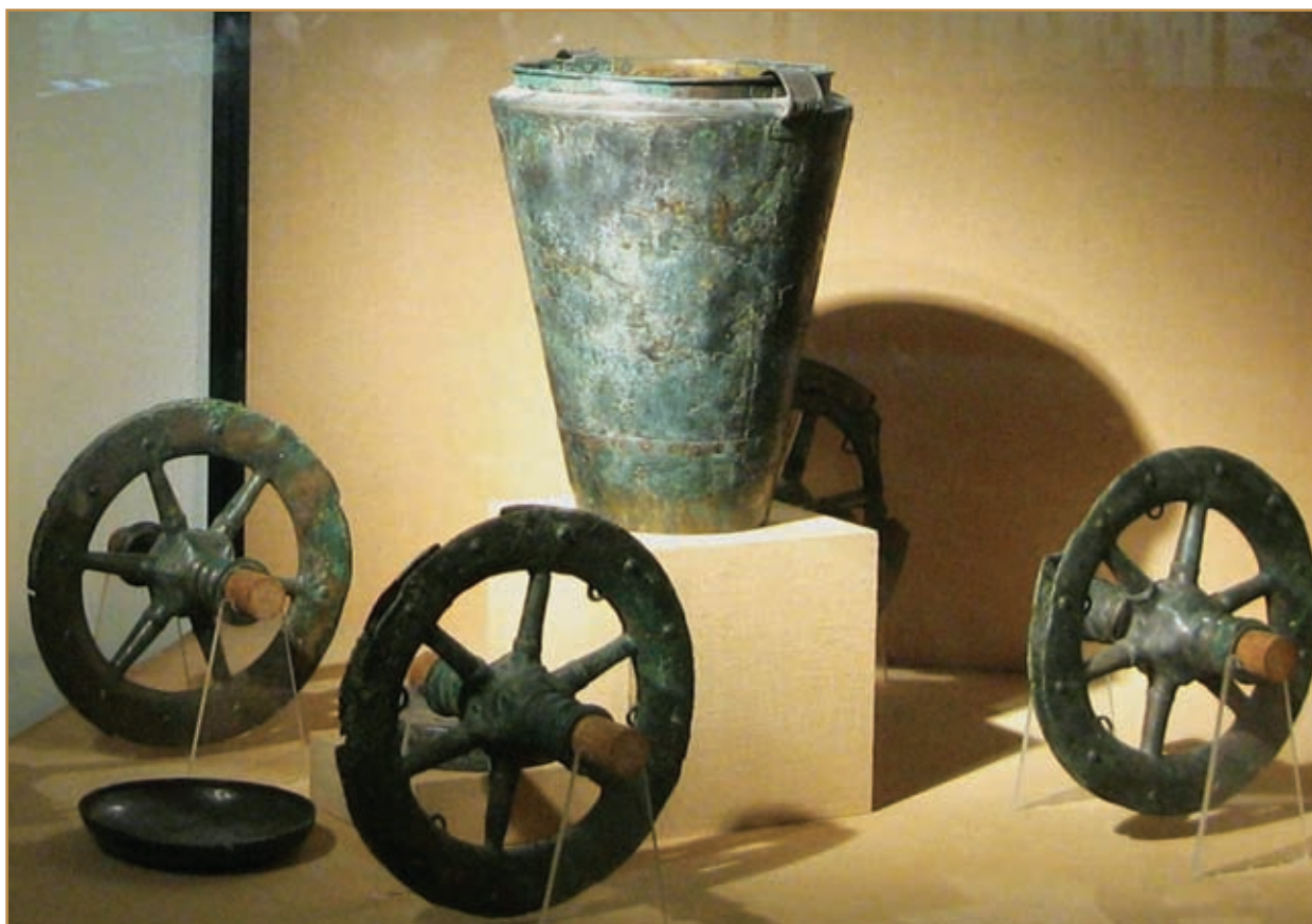
Four chariot wheels and a huge urn used by Celtic tribes in Gaul before the Roman Empire.

with intricate and colorful patterns or stylized depictions of ANIMALS.