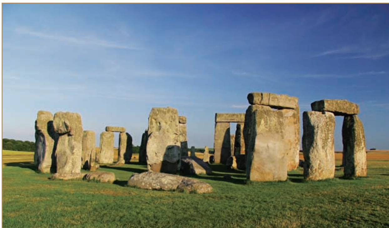
Circle of stones known as Stonehenge, England. Legend says Merlin used his magic to move the ancient stones from their original site to the battlefield grave of the Welsh nobles killed by the Saxons.

Scottish folktales describe why mermaids are considered dangerous seducers of men: Eager for