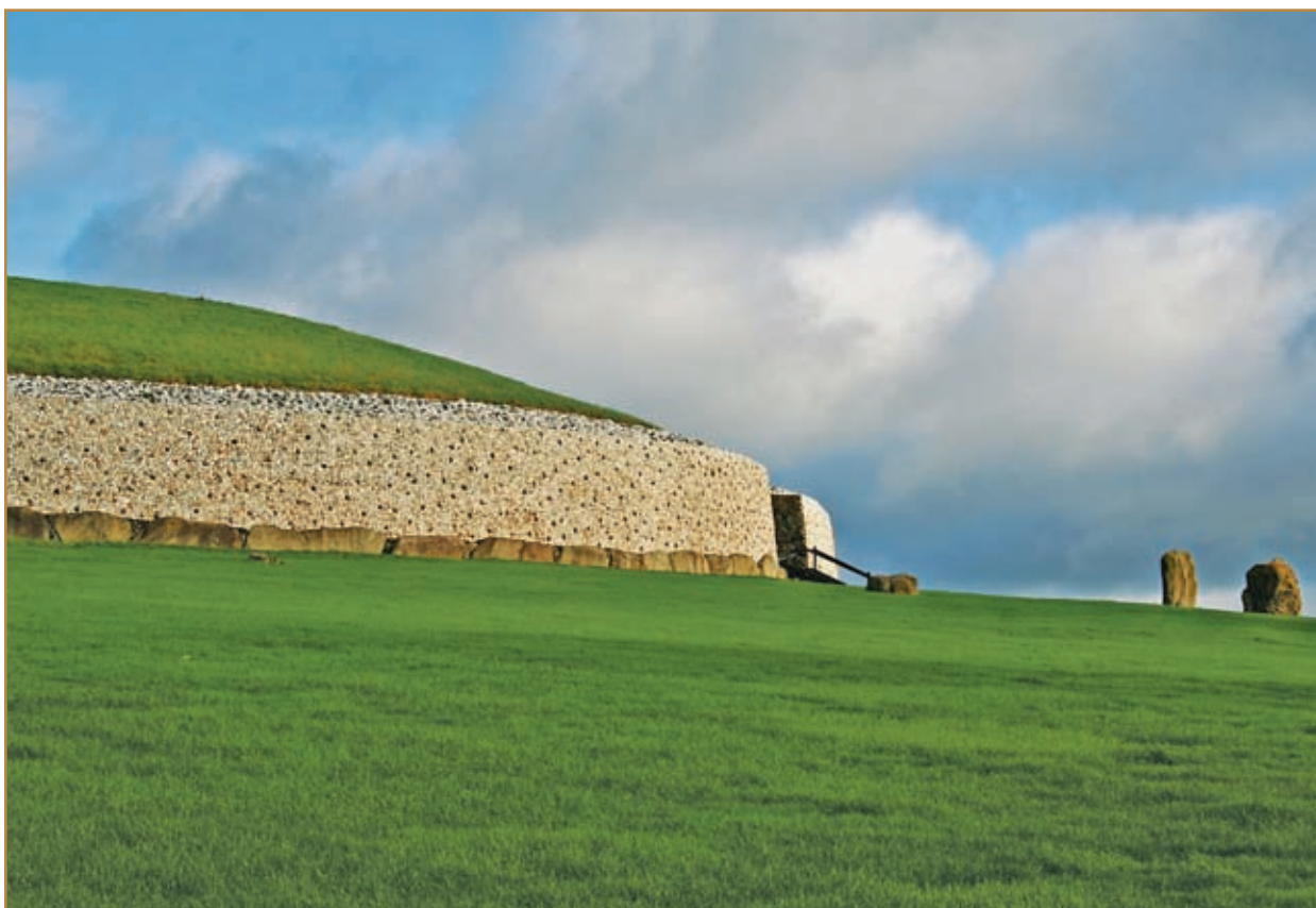
Newgrange gravesite from 3100 B.C. near the Boyne River in Ireland, believed by the Celts to be a passage to the Otherworld. (Used under a Creative Common license)

NEWGRANGE A gravesite near the RIVER Boyne in Ireland that was built around 3100 B.C. Early CELTS would have considered it a passage to the OTHERWORLD. Some say the site is BRUGHNA BÓINNE, the home of BÓAND and DAGDA and later ANGUS ÓG. (See also SIDH .)