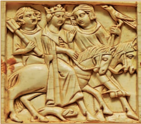
Irish Princess Iseult is escorted to the castle of her fiancé, King Marc'h, by the king's nephew Tristan in this scene carved into an ivory casket from 14th-century.

the men but instead transformed herself into a monster or a HAG. She demanded that the warriors fight her one by one. The men, including Oisín and OSCAR, were afraid and refused to do battle. Goll was the only warrior brave enough to battle and kill Irnan.