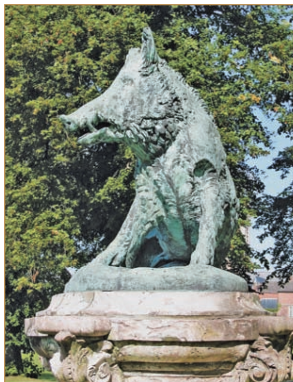
17th-century bronze statue by Pietro Tacca of a wild boar on the grounds of an estate in Enghien, Belgium.

Another Irish river goddess, SINANN , suffered a similar fate. She was drowned when she tried to drink from CONNLA'S WELL , also a source of supernatural wisdom. Bóand's husband, the water god NECHTAN (1), was the caretaker of that sacred well, although Connla's Well and the Well of Segais may in fact be one and the same.