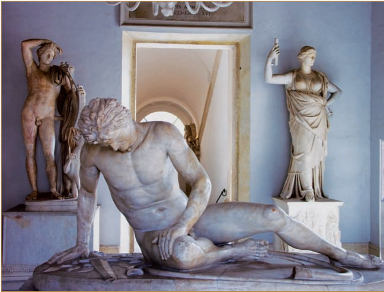
Marble copy of a Greek bronze statue, dubbed the Dying Gaul . It was made to commemorate the defeat of the Galatians of Asia Minor by Attalos I of Pergamon in the third century B.C.

one nationality, or one tribe of people. They even spoke different dialects of their common language.