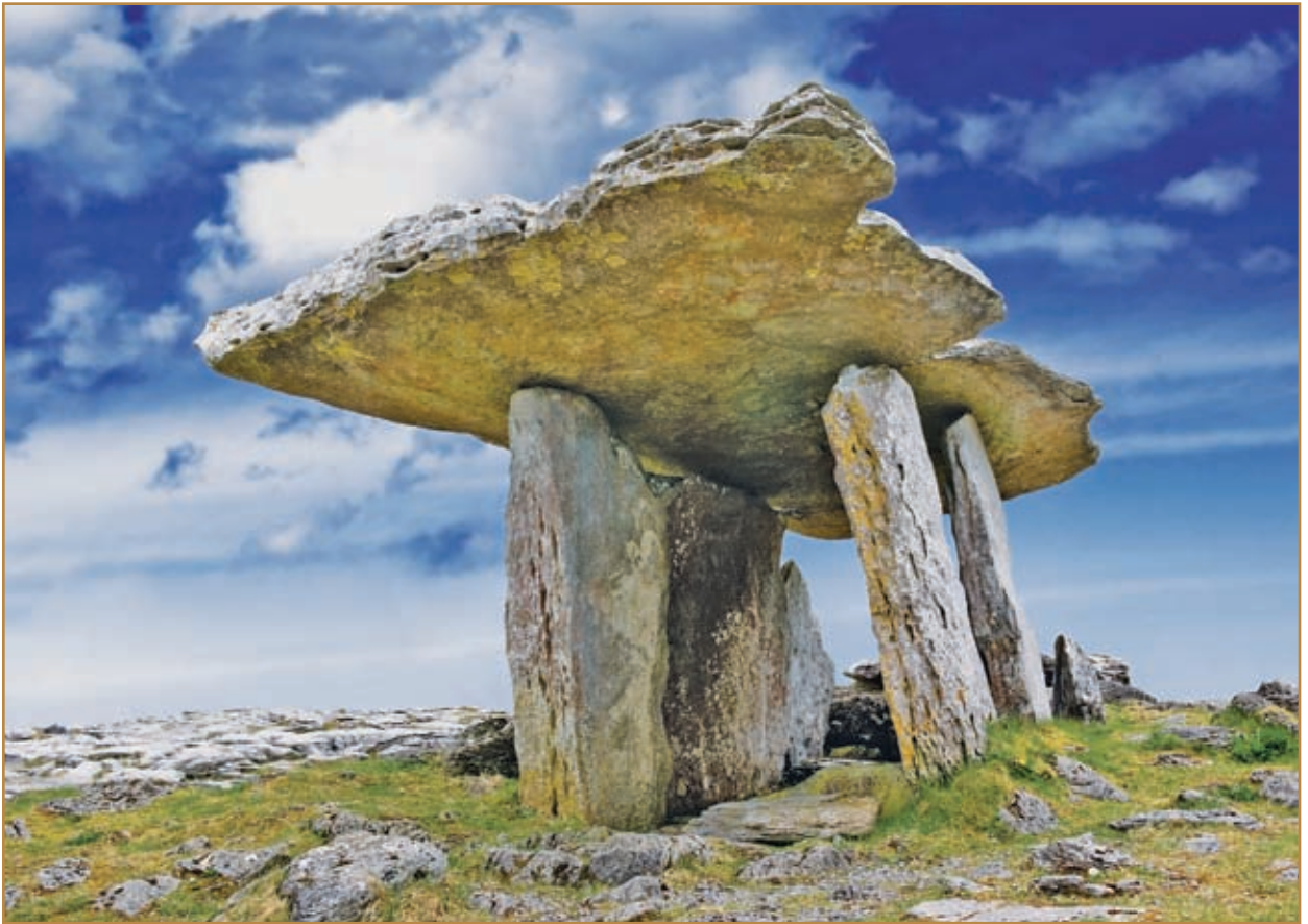
The 5,000-year-old portal tomb called the Poul nabrone dolmen is located in the limestone Burren area of County Clare, Ireland.

every night while fleeing the aging Irish hero FIONN, to whom Gráinne was engaged to be wed.