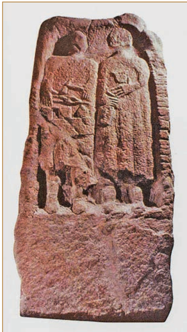
A stone stele, or pillar, depicting the Celtic god Sucellus with his consort, the Gaul water goddess Nantosuelta.

especially among sea merchants and sailors, and she was worshipped by CELTS and Romans alike. Nehalennia was most often depicted with a dog. She