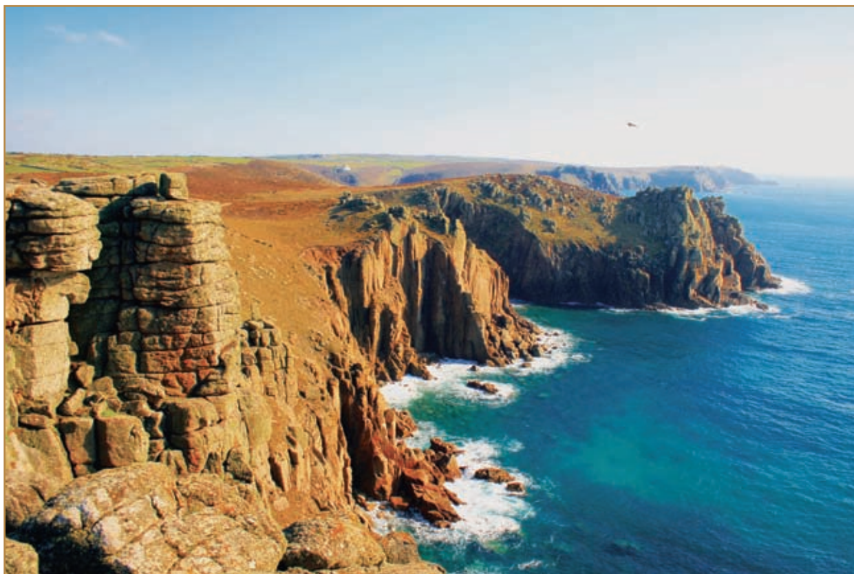
Land's End in Cornwall, said to be near the lost island of Lyonesse and the city of Ys.

the oldest is a Cornish tale of the sunken city of Lyonesse. Later versions, such as The Bells of Ys , were heavily influenced by Christianity. The Sunken City of Ker Ys has Celtic themes of MERMAIDS and sea demons.