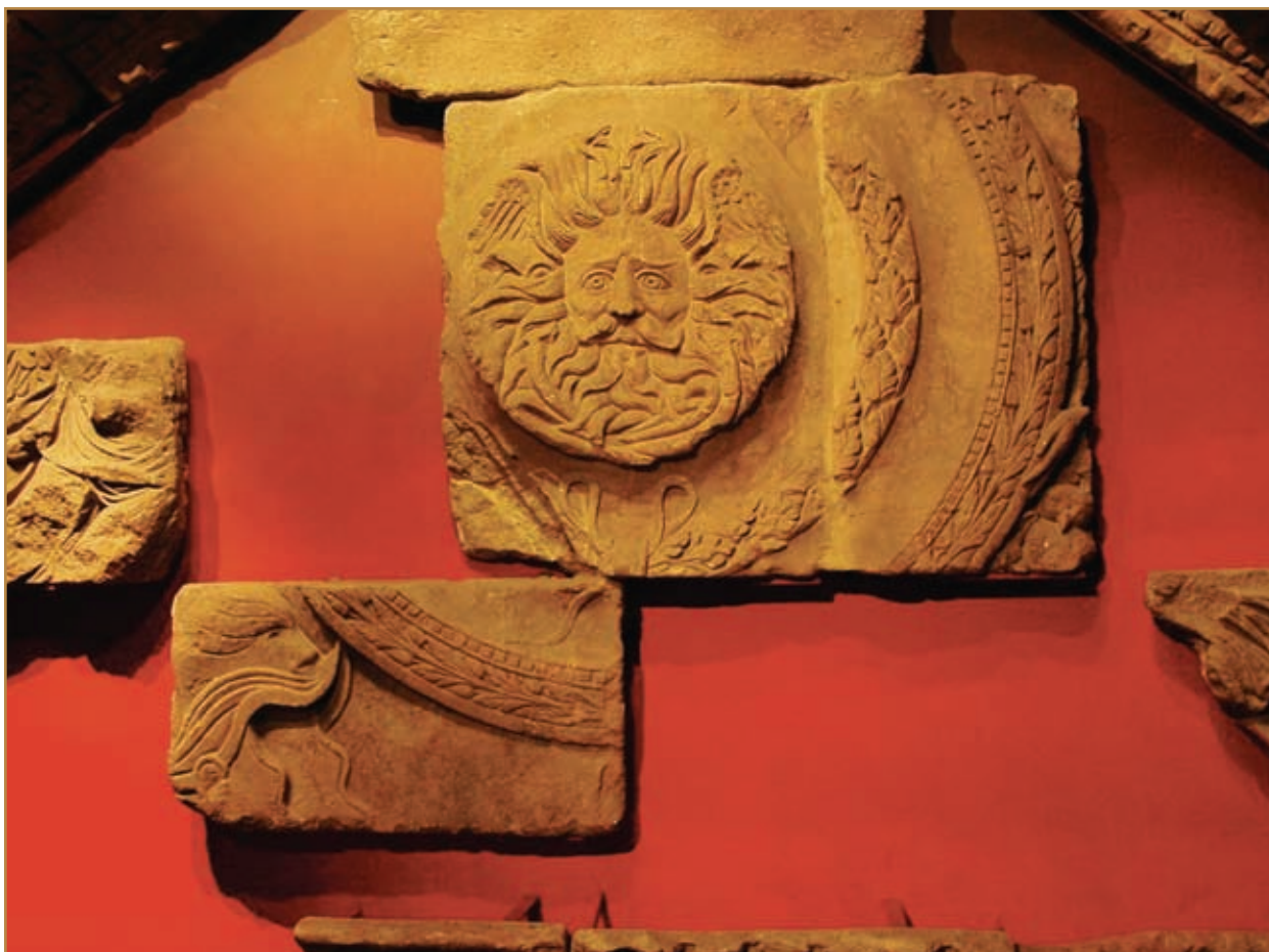
After Rome conquered England, several Roman temples were built and Roman gods were often substituted for Celtic ones. These fragments are from the Roman temple called Aqua Sulis, built in modern-day Bath.

RÚADÁN A FOMORIAN; the son of BRES the Beautiful and of the Irish goddess BRIGIT. Rúadán tried to kill the SMITH god GOIBNU but failed. When Rúadán died, Brigit mourned her son's death with a loud, wailing cry of sorrow. It was said to be the first KEENING ever heard in Ireland.