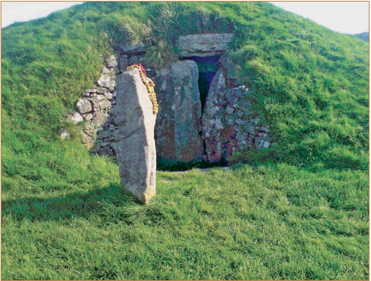
Prehistoric sídhe in Wales called Bryn Celli Ddu, or “mound of the dark grove.” The entrance is aligned so that on the summer solstice, the sun illuminates a quartz stone at the back of the cave. Such mounds were believed to be entrances to the Otherworld.

Tipperary, Ireland, which has both mythical and historical associations. The mountain was connected with the tales of the hero FIONN MAC CUMHAIL and his dealings with the ancient female FAIRIES known as the FEIMHIN, who lived on the mountain. When Fionn mac Cumhail was an old man, he decided to find a wife by offering himself as a prize to the first woman to reach the summit of Sliabh-na-mBan, where he would be sitting in judgement. The winner was GRAINNE, a young beauty, but on the night of their wedding feast, she ran off with a young man who was eventually killed by Fionn mac Cumhail.