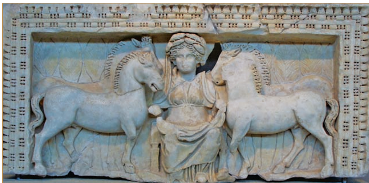
A Greek fourth-century stone relief of the horse goddess Epona.

EPONA An important and popular Celtic HORSE goddess who was revered as a symbol of power and of the earth's fertility. She was worshipped in many dif-