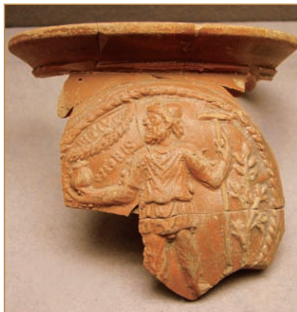
A terracotta medallion depicts the "Striker God" Sucellus holding his hammer and pot.

SUCELLUS (SUCELLUS, The God Striker) A Gaulish god whose function is unclear. He carried a large HAMMER. He was possibly a KING of the gods or a god of the dead. The cup or purse he carried could mean that he was a fertility god or a god of wealth and well-being. His consort was the water goddess NANTOSUELTA.