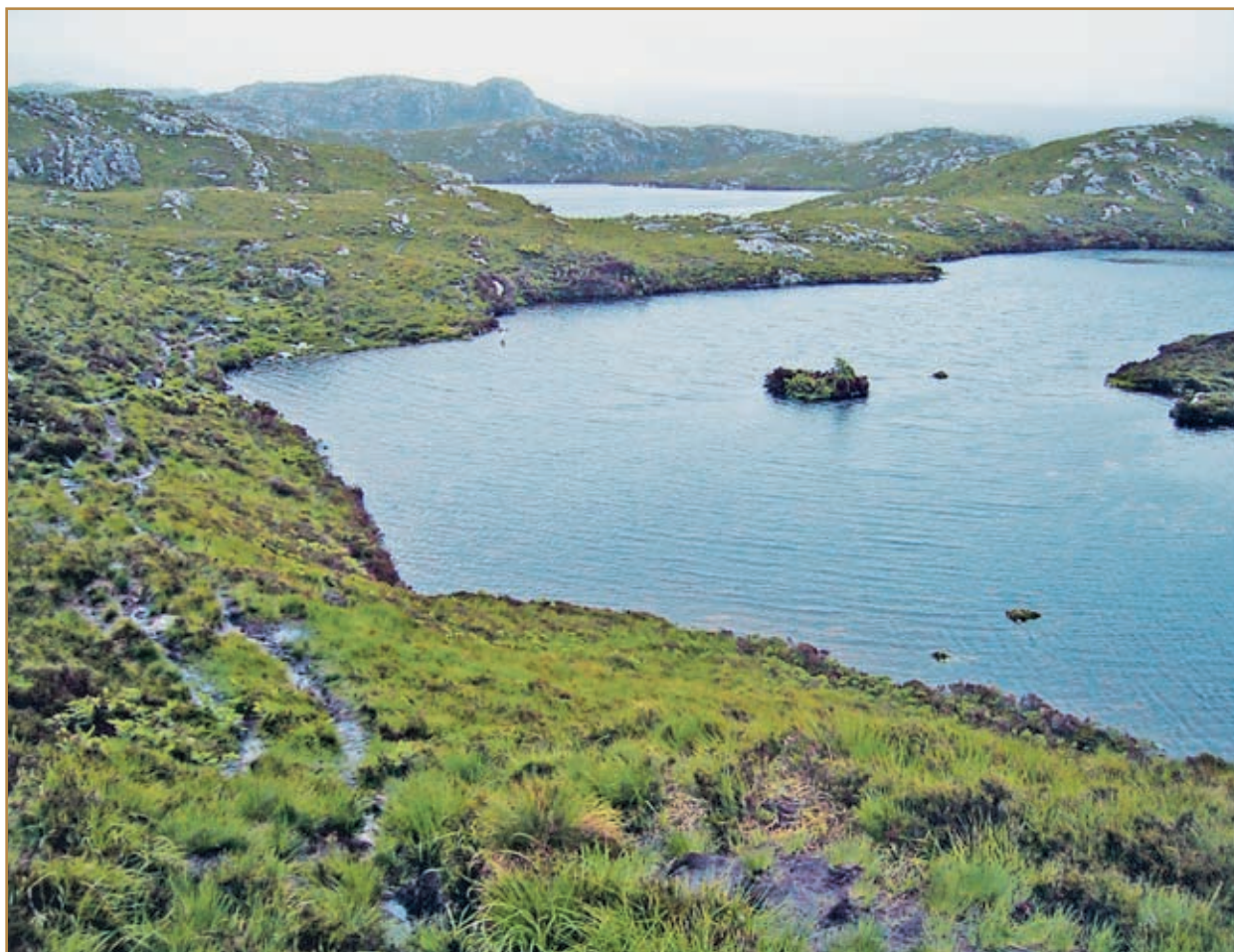
Celts believed that fairies lived in the Otherworld, which had entry points in various geographical features, such as deep lakes like this one.

OSCAR A great FIANNA warrior, son of OISÍN, and grandson of FIONN. He battled GOLL MAC MORN in a show of his great strength. His most important battle, however, was also his last. In CATH GABHRA (the Battle of Gabhair ), Oscar and the HIGH KING CAIRBRE LIFECHAIR exchanged mortal blows. Fionn wept at Oscar's death, the first and last time Fionn shed tears over one of his men.