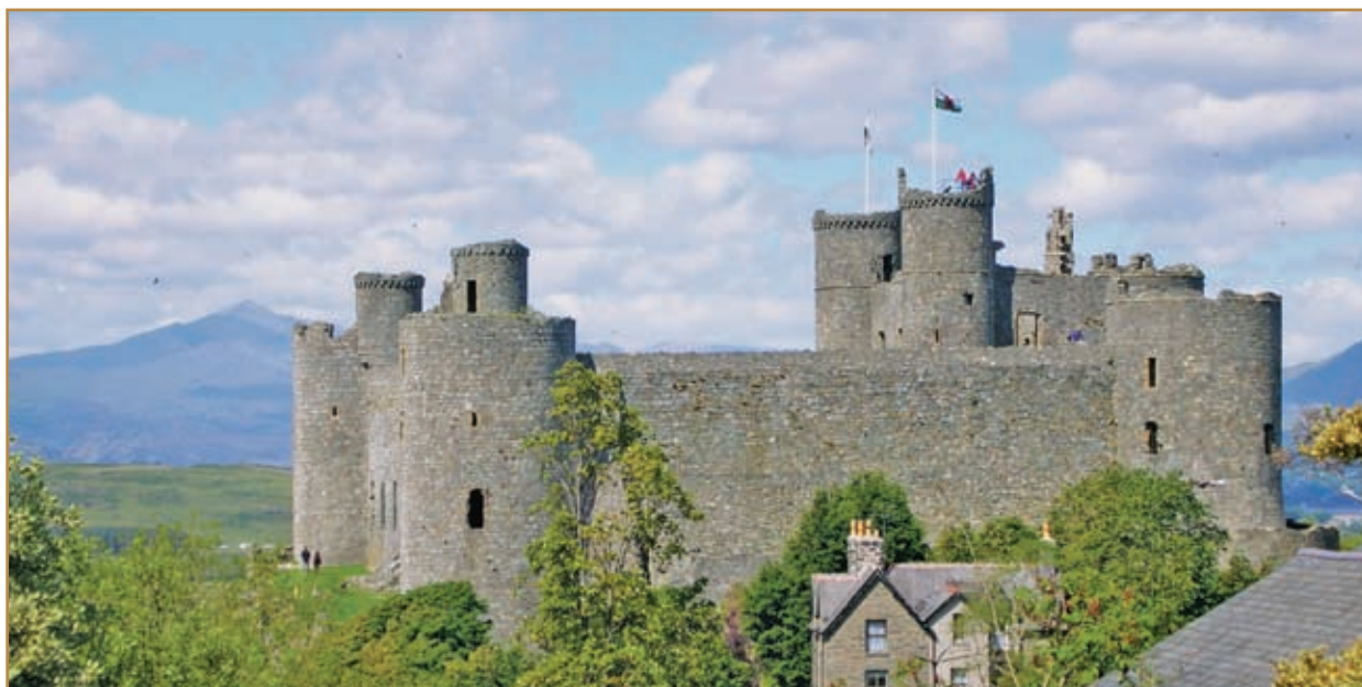
Harlech Castle sits on the site of Bran the Blessed's stronghold in North Wales.

BRAN (2) The swift-footed hunting DOG of FIONN, the great and wise leader of the FIANNA. Strangely enough, the hound was the son of Fionn's