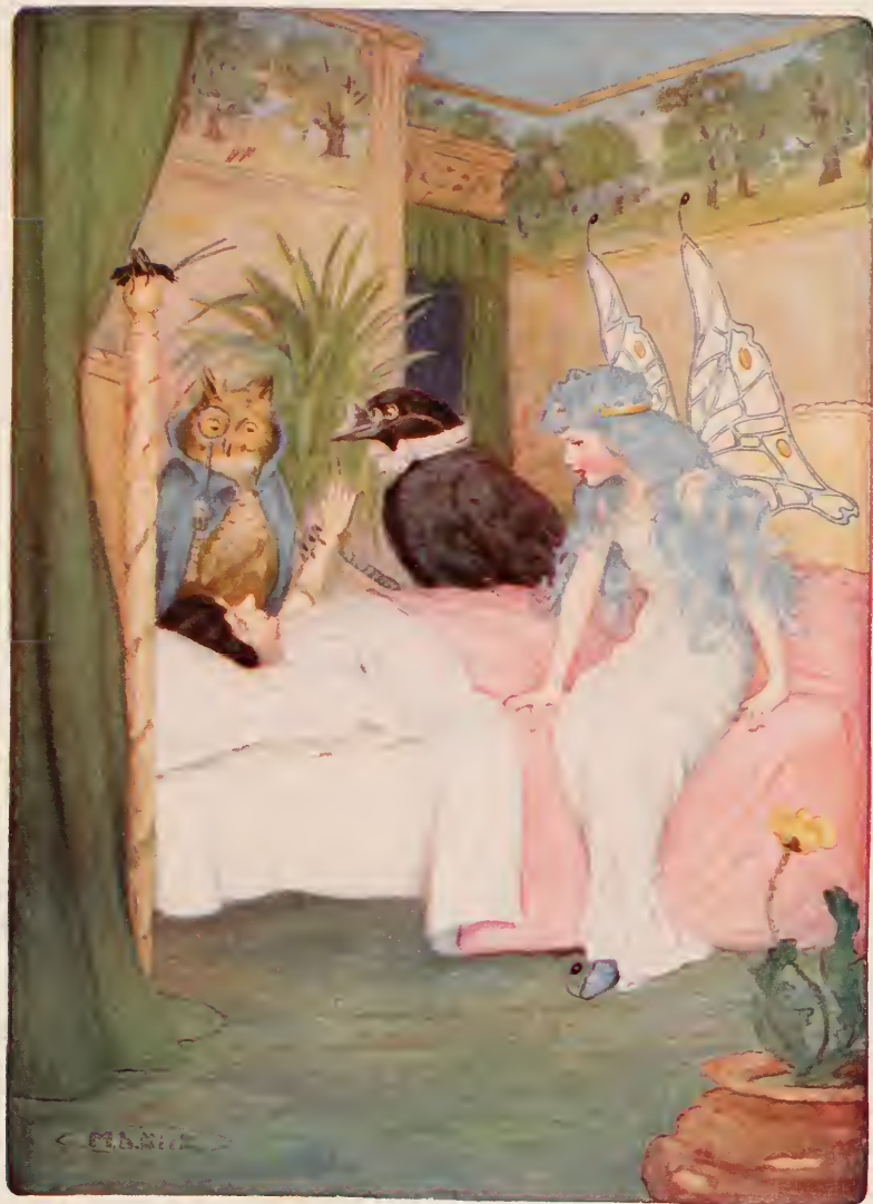
THE CROW, ADVANCING FIRST, FELT PINOCCHIO'S PULSE