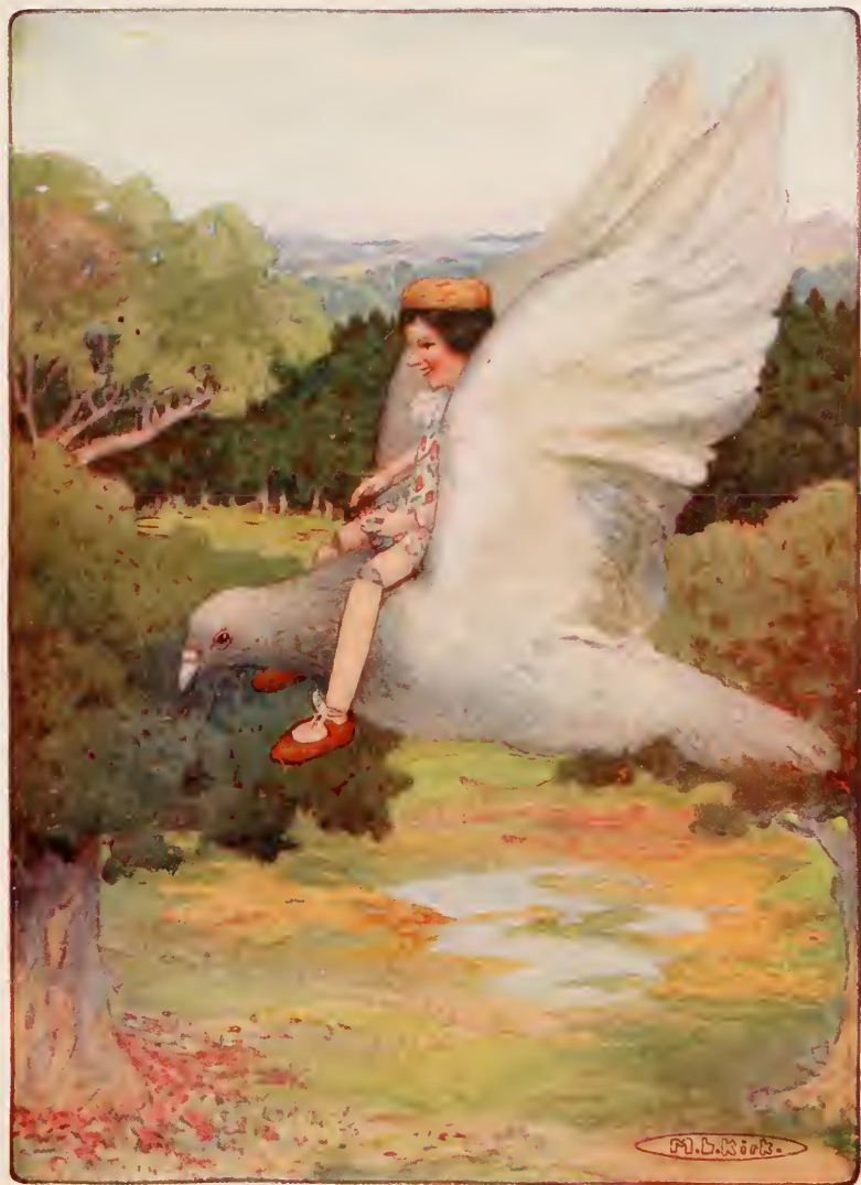
"GALLOP, GALLOP, MY LITTLE HORSE"