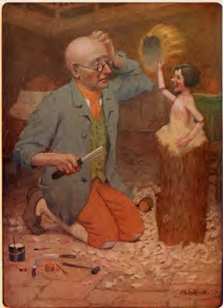
HE SAW HIS YELLOW WIG IN THE PUPPET'S HAND