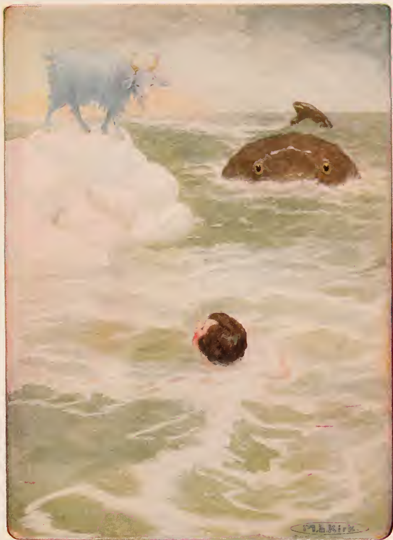
HE SWAM WITH REDOUBLED STRENGTH AND ENERGY TOWARD THE WHITE ROCK