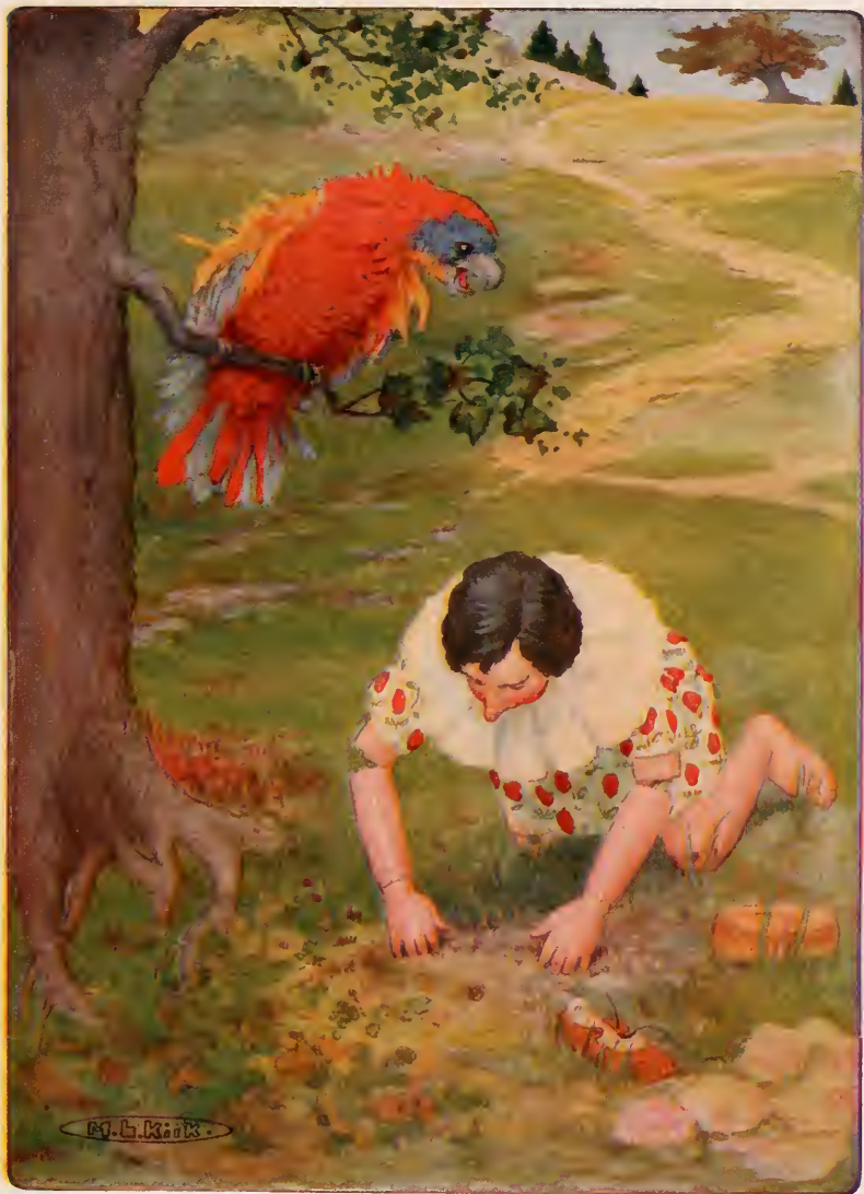
HE BEGAN WITH HIS HANDS AND NAILS TO DIG UP THE EARTH THAT HE HAD WATERED