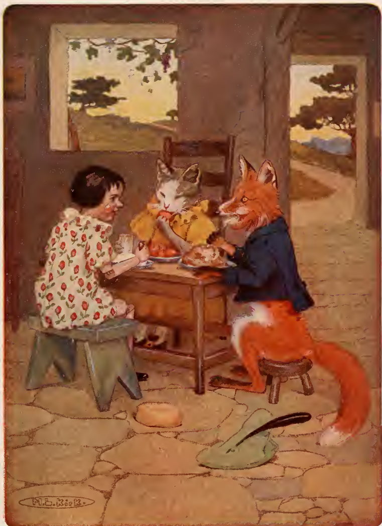
THE ONE WHO ATE THE LEAST WAS PINOCCHIO